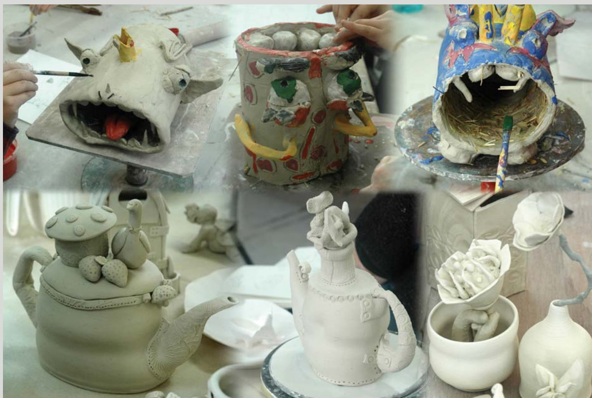
Whimsical hand-building ceramics, both from the children's course with Karen Farrell (top row) and the adult course with Fleur Schell – always a popular choice.

Last July, Sturt Winter School was at capacity with more than 150 enrolled students, including 43 children and youths who attended for single days or for the full series of one-day workshops.