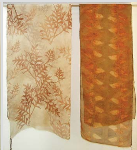
Silk scarves by Julie Ryder