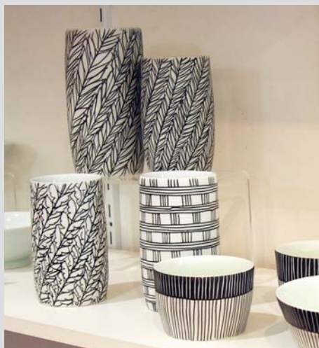
Porcelain bowls and vases by Bronwyn Kemp

And some Husque frag bowls made from recycled macadamia nut shells in very imaginative vivid colour.