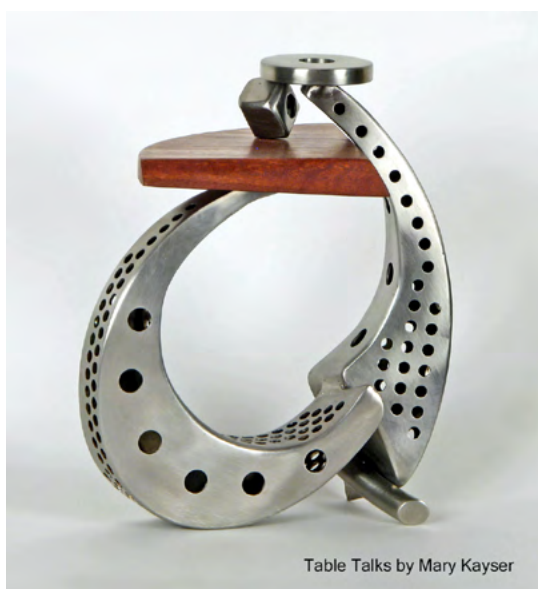
Table Talks by Mary Kayser

*NB Mary will also bring a selection of tools and materials that can be used within the class.